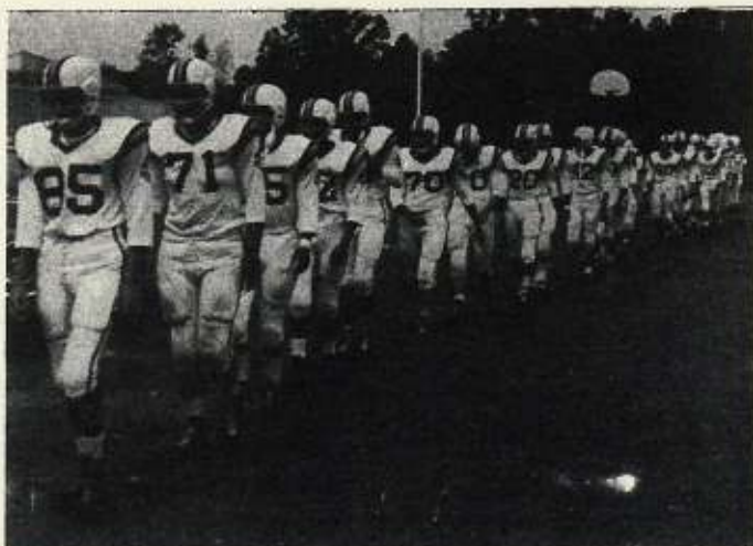
Crossland's first varsity football team marches on the field ready to tackle the tough Central team.