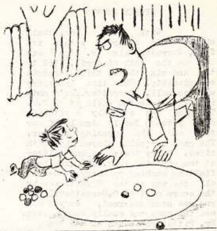
"I am TOO a good loser!"