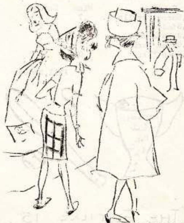
I agree with Dad's talk about how we should make sacrifices in the world against communism. Can't I just get my new "PROM" outfit?