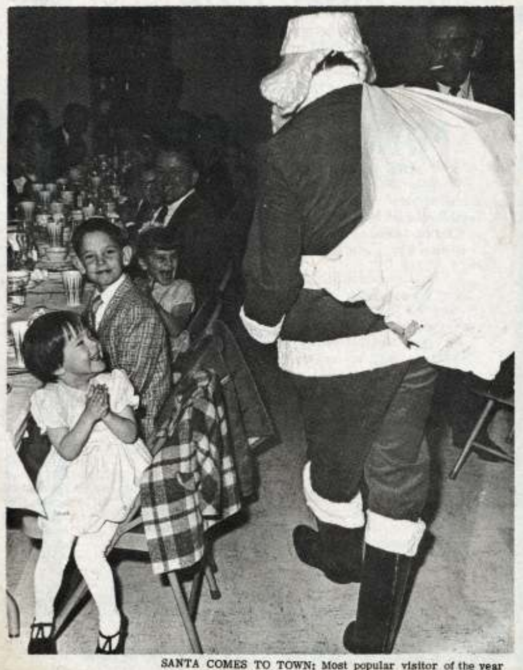
SANTA COMES TO TOWN: Most popular visitor of the year was the man in the red suit and a Ho, Ho Ho. He is shown above with one of his young admirers.