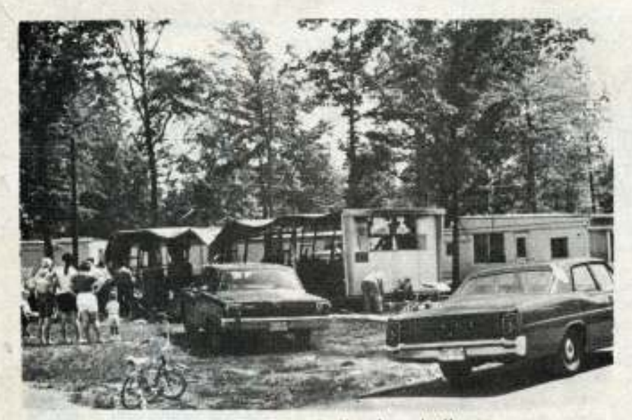
INFANT DEATH IN TRAILER FIRE: In the above trailer an infant met death when the trailer caught fire.