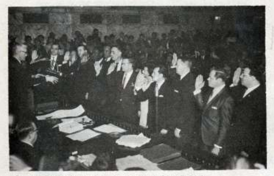
P.G. DELEGATION TO ANNAPOLIS: The Prince Georges County Delegation is sworn in at Annapolis,