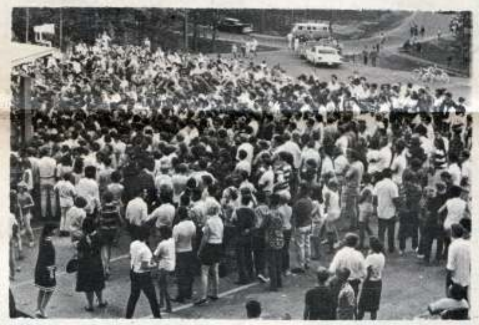
CLINTON REGIONAL PARK OPENS: Part of one of the many crowds drawn to the area's newest recreation facility.