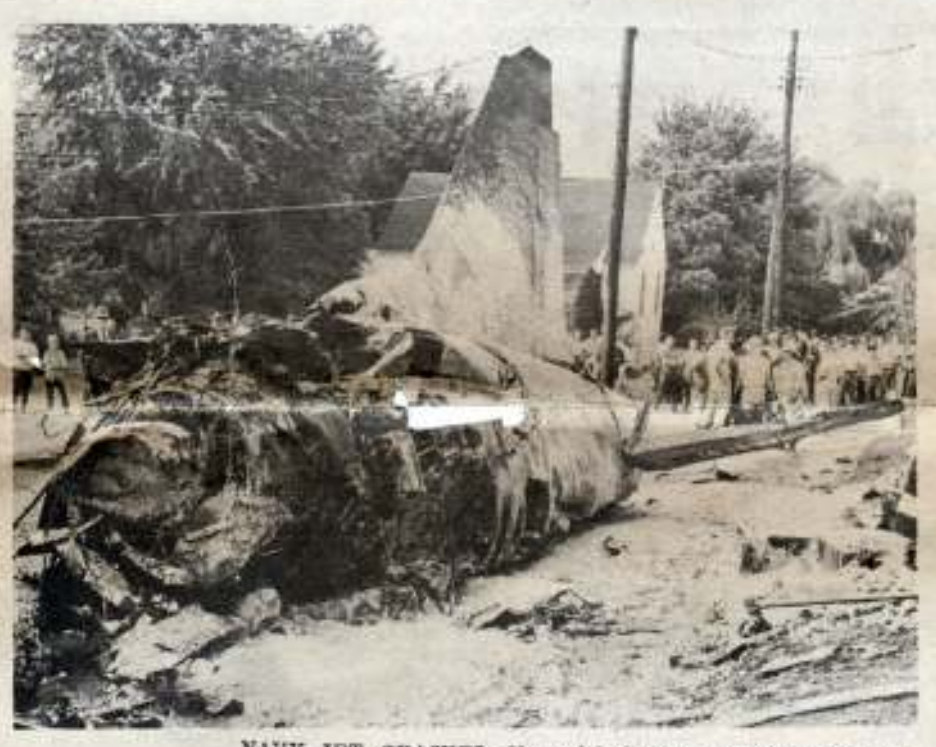
NAVY JET CRASHES: Navy jet fighter crashed while attempting to land at Andrews, destroying a Forestville home.