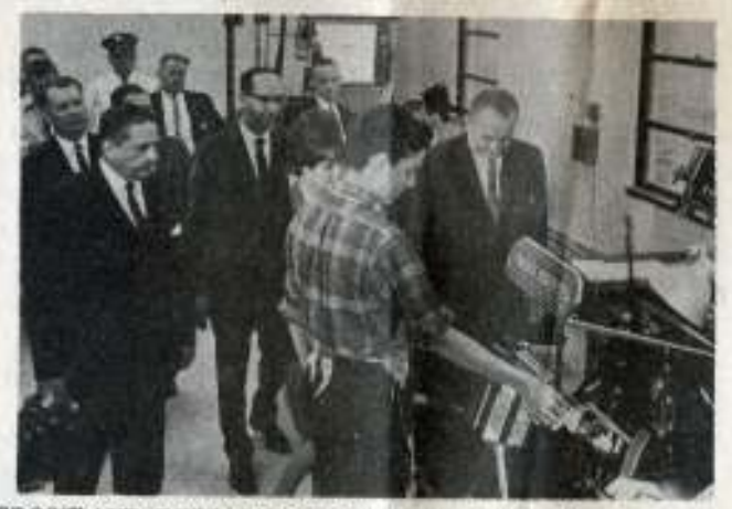
CROSSTAND DEDICATION: President Lyndon B. Johnson inspects part of the vocational equipment at Crossland during dedication program he attended.