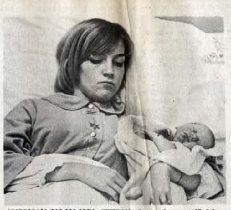
AMERICA'S 200,000,000th CITIZEN: Census bureau officials named a Forestville infant as America's 200,000,000th citizen.