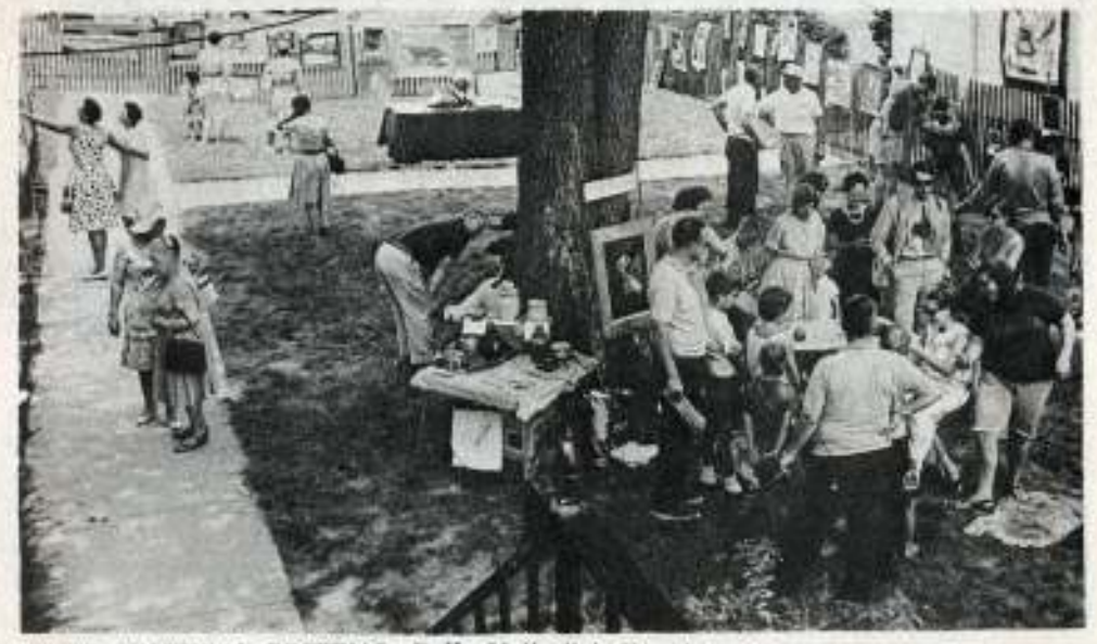
FIRST CULTURAL FESTIVAL: Bells Methodist Church held their first Annual Cultural Festival.